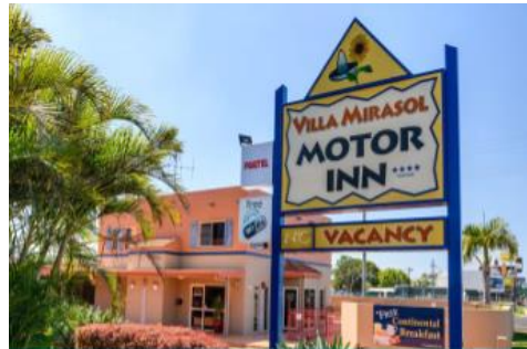
Villa Mirasol Motor Inn