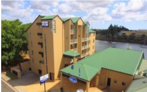
Burnett Riverside Hotel